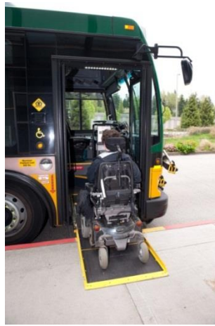
People with Disabilities