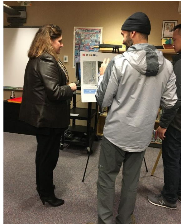
Community priorities were identified by discussing concepts with meeting attendees