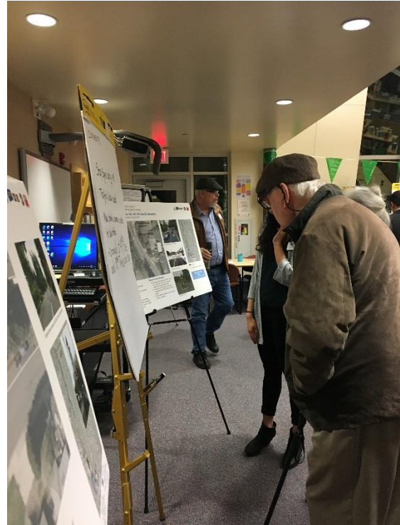
Attendees were able to provide comments by talking to staff directly or by filling out comment cards