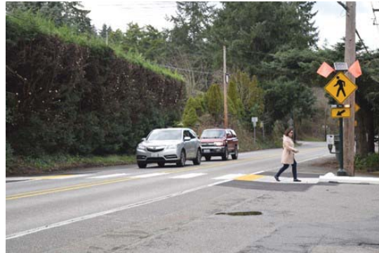
Figure 2 Rapid Flashing Bea-

Please note: Existing on-street parking on the eastside of 156 th Avenue NE will remain.