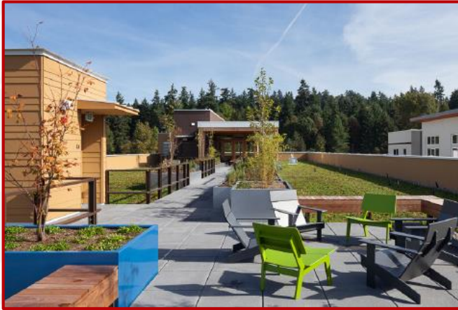
Velocity, South Kirkland Park & Ride