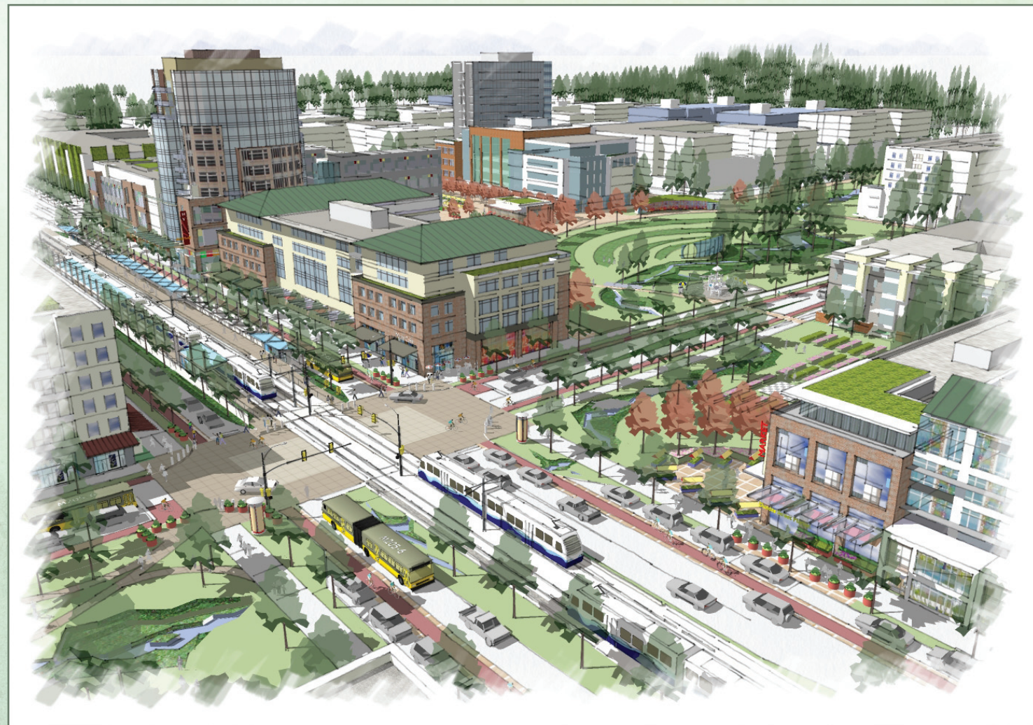
Redevelopment concept around 130th Ave. NE Station