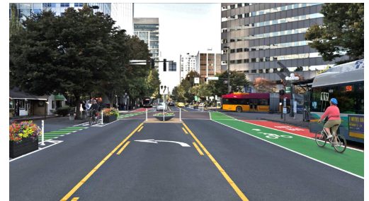
At Bellevue Transit Center, looking north