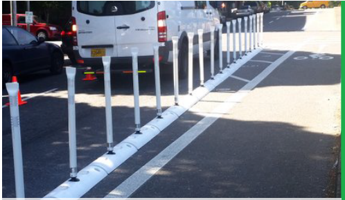
Near 2nd, 4th, 6th, 8th, and 12th Street