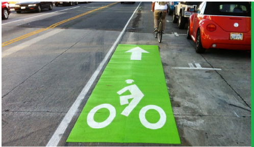
At right turn lanes and driveways