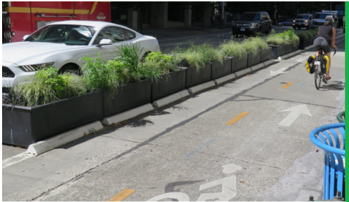
Near 2nd, 4th, 6th, 8th, and 12th Street