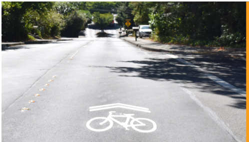
North of Main St and at NE 2nd Pl