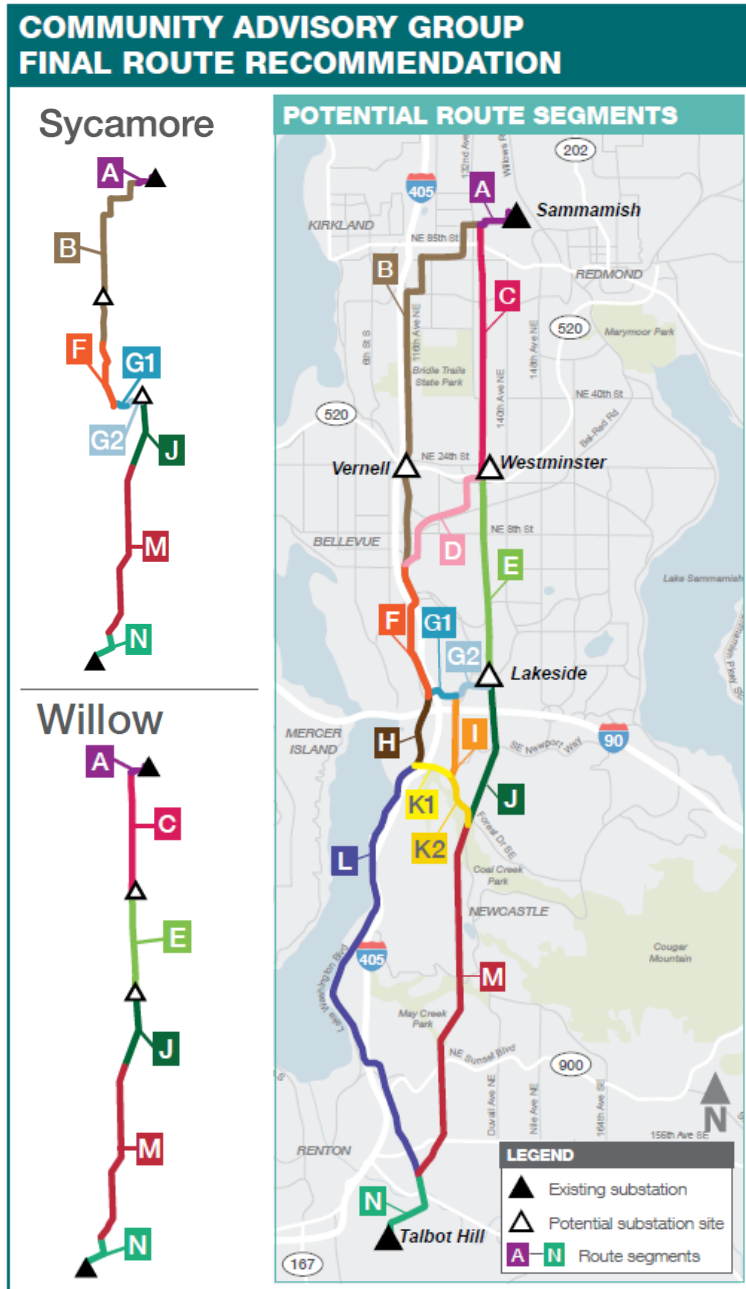
Figure 1: Final Route Recommendation ( Willow ) and Potential Route Segments

More information related to the Sycamore (shown as Segment B on Figure 1) and Willow routes are provided below.