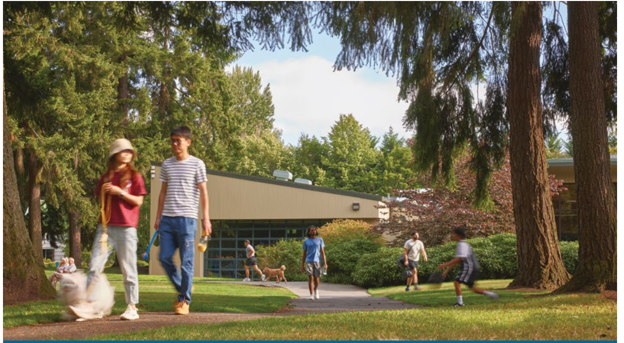
People walk in Crossroads Park with the Crossroads Community Center in the background.