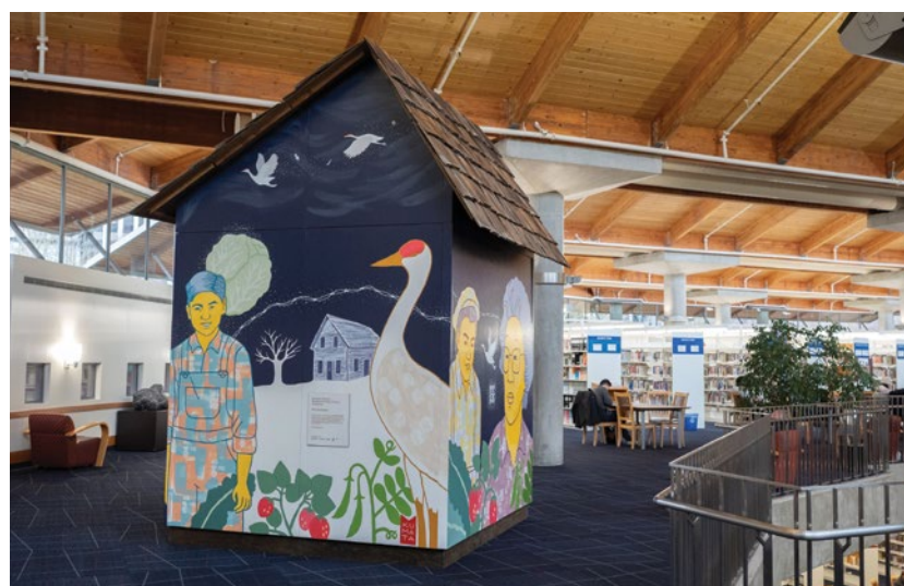
The Emerging Radiance farmhouse can be seen at the Bellevue Library, on the second floor.

In 1942, after the bombing of Pearl Harbor, Bellevue's residents of Japanese descent, like 120,000 others from cities up and down the West coast, were stripped of their rights and sent to prison camps. Only a few of