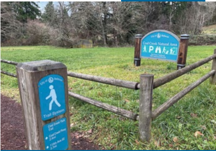
Coal Creek property acquired