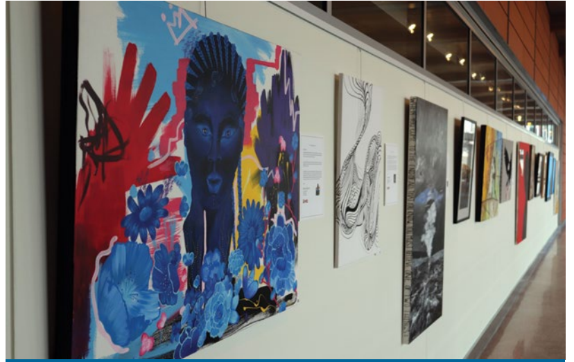
Many of the two-dimensional art pieces hang along the second-floor catwalk at City Hall.

More exhibits and events from the city's Diversity Advantage Team celebrating Bellevue's diverse cultures and communities can be found at BellevueWA.gov/diversity-events .