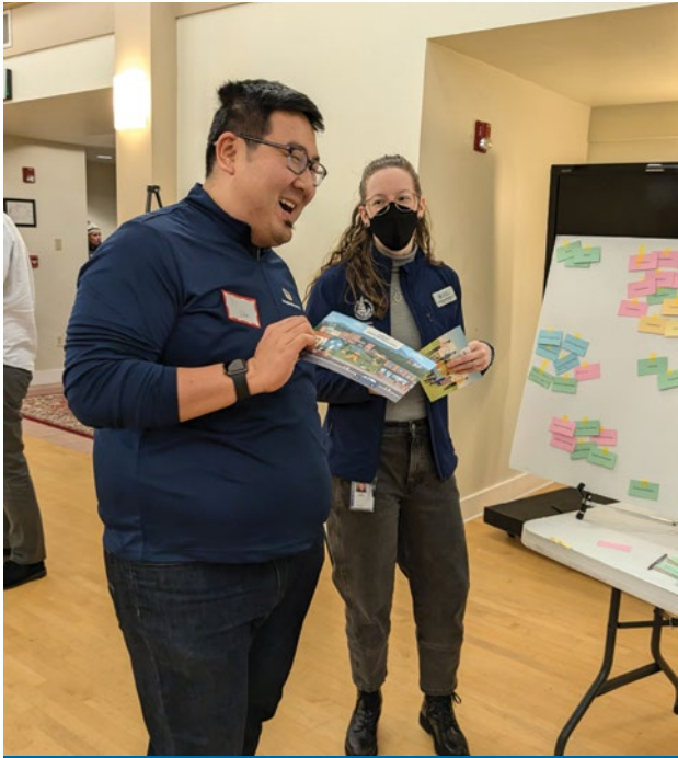
A participant smiles at a Newport ideas fair.