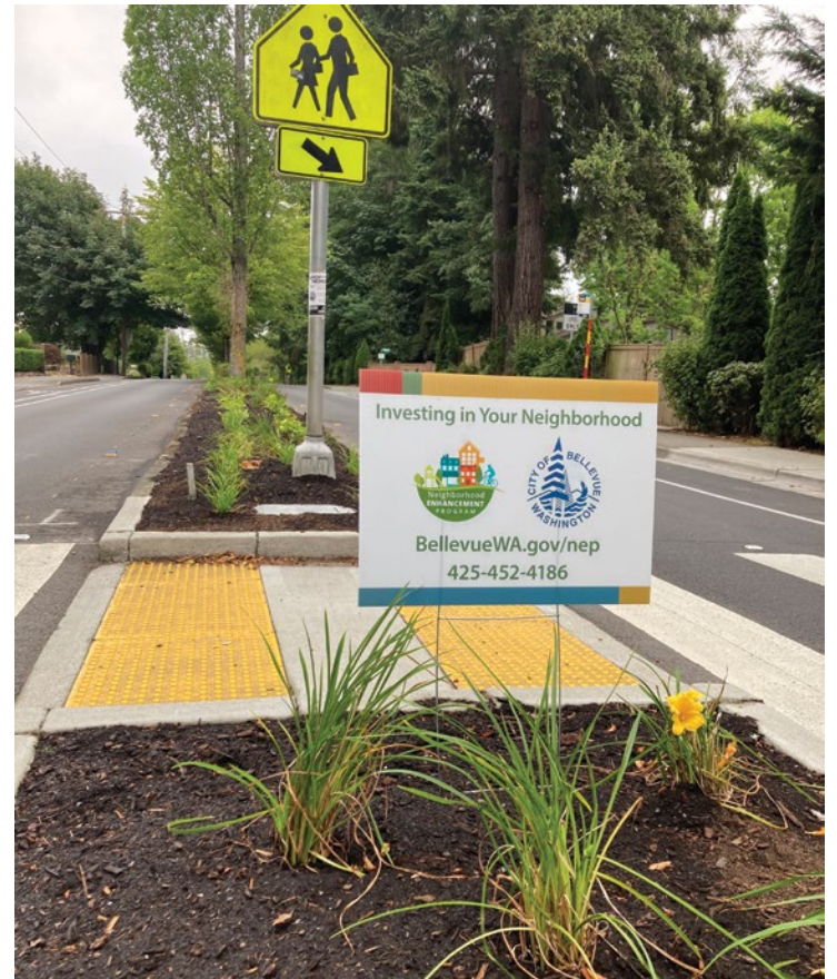
An enhanced crosswalk on Main Street near 148th Avenue was a Neighborhood Enhancement Program project.

For more information on the NEP program and when it will be in your neighborhood area, visit BellevueWA.gov/NEP .