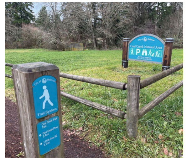
The property the city acquired contains critical environmental areas and a trail that connects to the city's trail system in the Coal Creek Natural Area.