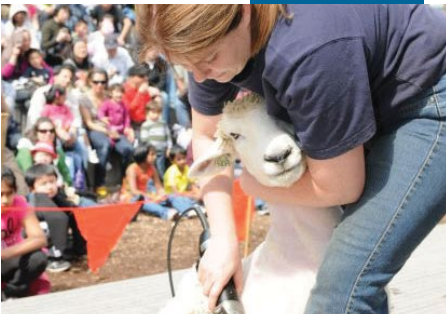
Sheep-shearing in the spring