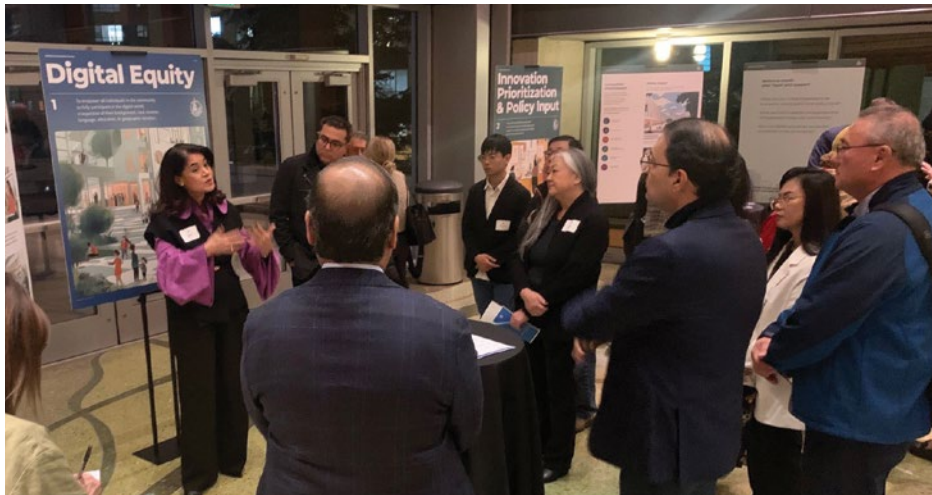
Local business leaders and others gather at City Hall in November to brainstorm about inclusive innovation.

To learn more about Bellevue's 2023 greenhouse gas inventory, EarthFest 2025, or the Sustainable Bellevue Plan Update, visit BellevueWA.gov/environment .