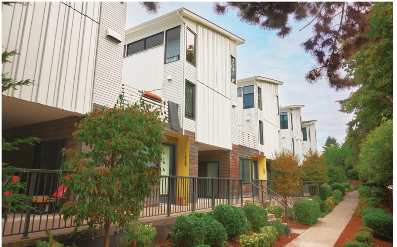
More housing options like Park East Apartments can enhance choice in Bellevue

We're early in the process of updating our Affordable Housing Strategy, with a doubled