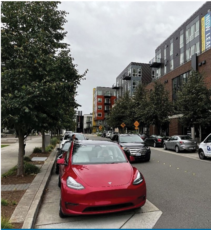
Jockeying for parking is serious business in BelRed's Spring District.