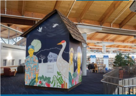
New art at Bellevue Library