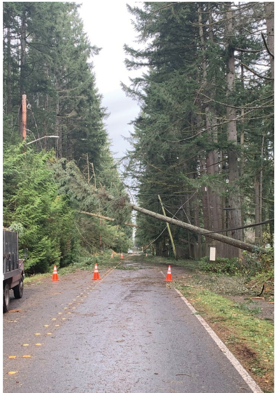
Many trees hung across streets like this one over 132nd Avenue Northeast after the Nov. 19 bomb cyclone.