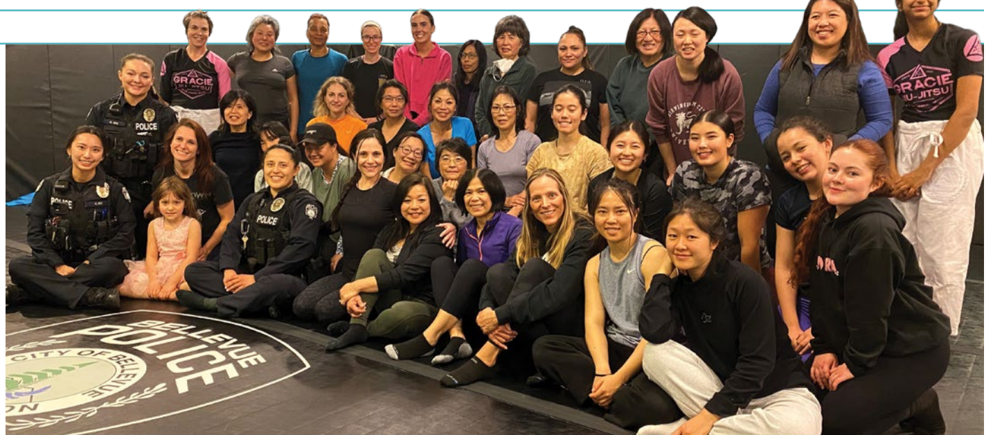
Participants in the Bellevue Police's Women Empowered self defense class pose after a session. Uniformed officers, including Craig Hanaumi (not pictured), usually lead the class.