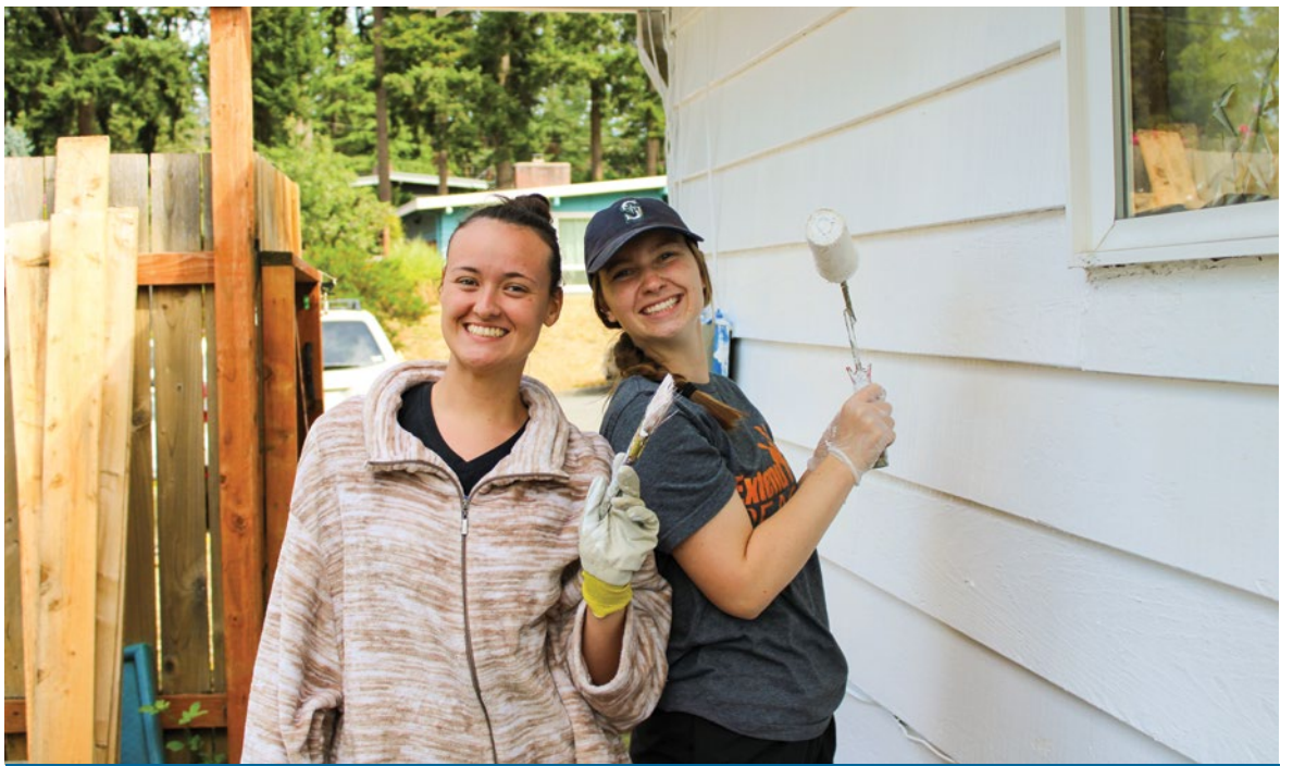
A couple of Jubilee volunteers spare a moment for a smile while they paint a house.