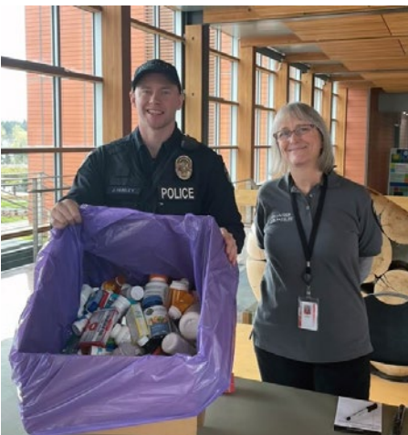
Drug Take Back