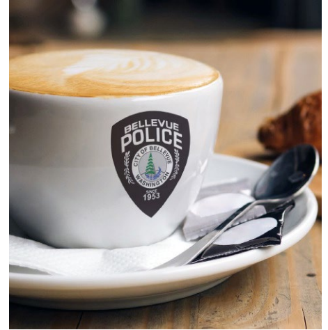
Coffee with a Cop