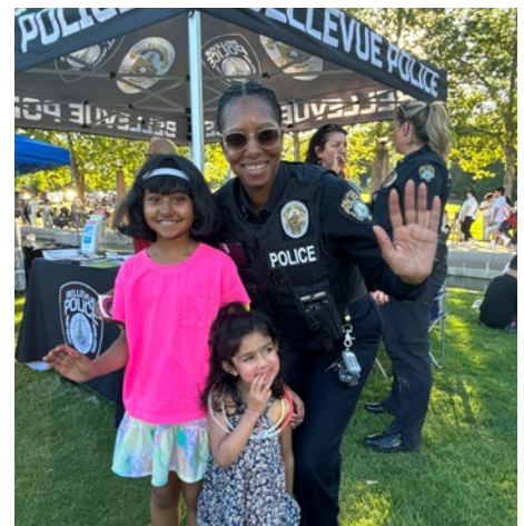
Bellevue Family 4th