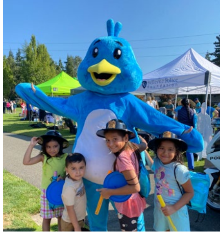
National Night Out