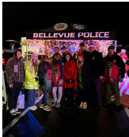
Battle of the Badges