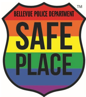
BPD Safe Place