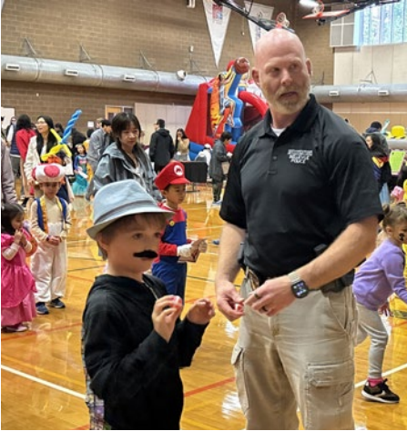
Halloween on the Hill