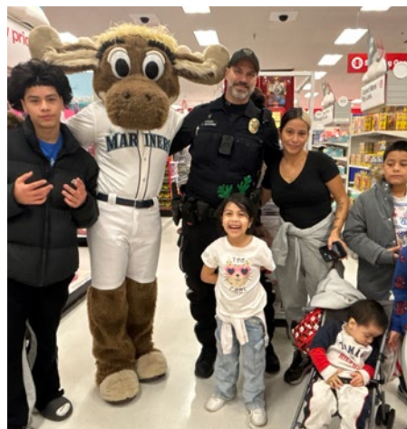
Shop with a Cop