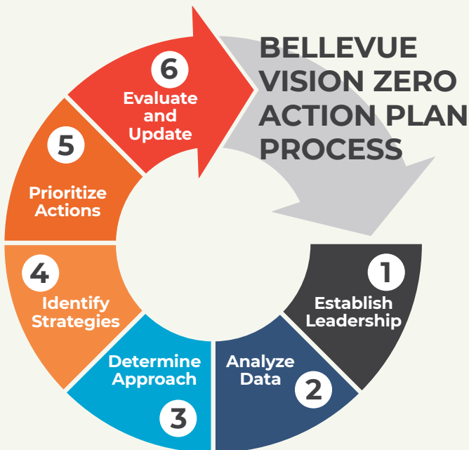
Figure 1: Process to develop Bellevue’s Vision Zero Strategic Plan and annual Action Plans.

The City of Bellevue is using a six-step process to develop, implement, monitor and refine its Vision Zero strategy (see Figure 1).