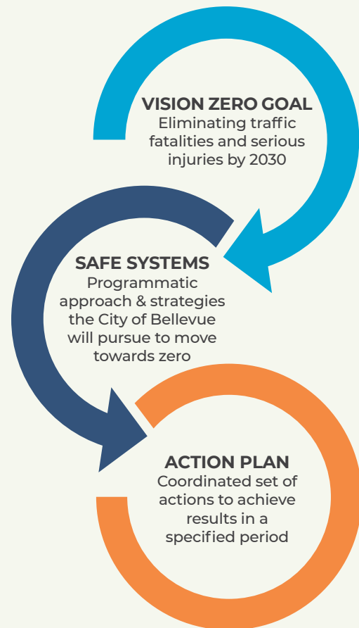
Figure 4: Annual Action Plans build on the Safe System approach and Strategic Plan—a yearly recommitment to address systemic traffic safety challenges holistically through interdepartmental “One City” collaboration.

In this context the Steering Team is working to find the best solution that delivers measurable improvement, is affordable and can be implemented in a reasonable time frame (see Figure 4). Annual Action Plans are living documents, to be continually updated as new data becomes available and as new Safe System actions prove to be successful in making Bellevue streets safer.