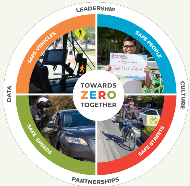
Figure 2: The Bellevue Safe System approach rests on four pillars (Safe Speeds, Safe People, Safe Vehicles and Safe Streets) paired with four supportive elements (Data, Leadership, Partnerships and Culture).

In its advisory role in the development of the city’s Strategic Plan, the Bellevue Transportation Commission examined the attributes of the Safe System approach and concurred that Safe People, Safe Streets, Safe Speeds, Safe Vehicles—as well as the supporting elements of leadership, culture, partnerships and data—all help contribute to reducing the frequency and severity of crashes (see Figure 2). This holistic approach accepts that people will make mistakes and that crashes will continue to occur, but it aims to ensure these do not result in serious injuries or fatalities.