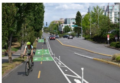
A candidate design for NE 12th Street, east of 102nd Avenue NE includes a two-way separated bike lane.

For more information and to sign up for project alerts, visit BellevueWA.gov/bike-bellevue . Design proposals for each corridor will be available in the Bike Bellevue Design Concepts Guide, which will be available on the project webpage.