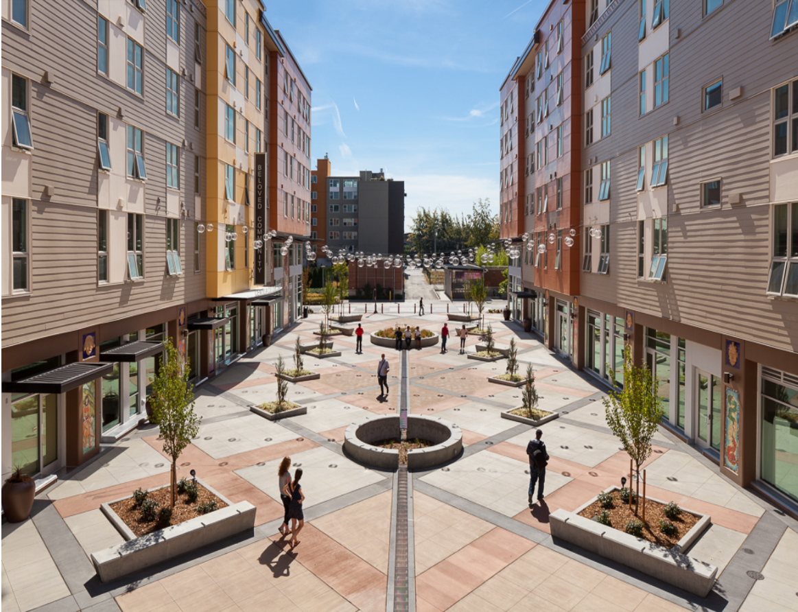
Plaza Roberto Maestas- El Centro de la Raza