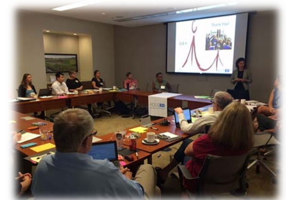
Housing and Education