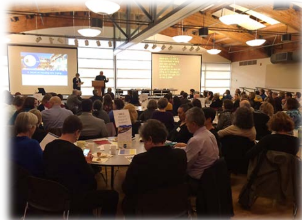
Housing and Aging